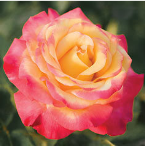
Dream Come True - Floribunda 2008 AARS Winner